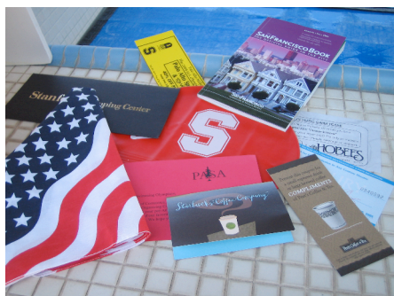
Several Palo Alto businesses donated coupons for the Olympic Swim Team.

Nationals and eventually the trip to Greece. While the team was training at Stanford, BASOC and the Palo Alto business