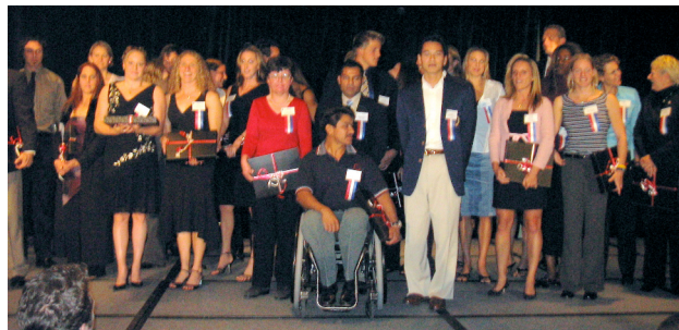
Roughly 100 Olympic and Paralympic Athletes were honored at the Ritz-Carlton.