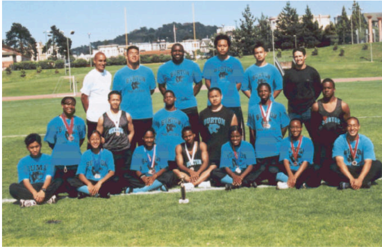
The track team at San Francisco's Burton High School can enjoy renovated athletic facilities.